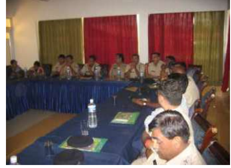
"Advocacy Workshop with District Police Department"

Our organization adopted a multifaceted strategy to reduce the rate of transmission among the most vulnerable and marginalized population through services such as Behavior change communication, Counseling, Condom Services, STD Services, Enabling Environment, Community Mobilization. Currently the TI Project of SVSS is focusing all major town and cities of Sehore district of Madhya Pradesh in Block Sehore, Ashta, Nasrullaganj, Rehati and Budni. In the year 2008-09 TI project was targeting 90 men having sex with men (MSM) and 320 Female sex workers (FSW). At Current year SVSS is providing services to 654 FSW and 225 MSM. HRG found HIV positive is diagnosed to Anti Revioul Treatment Centre (ART), DOT centre & ICTC.