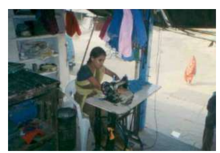
"View of Entrepreneurship Activity started after training"