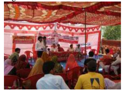
"View of Meeting with experts for Rabi & Kharif crop & other allied sector"

Under the FCP programme SVSS ensures the participation of the Small- Marginal Farmers, Raising the awareness level about the Programme, assisting them in seeking solutions to problems, training them for mechanical expertise and motivating them to form Farmers clubs. Apart from rendering technical assistance, the farmers are also assisted in accessing financial assistance from formal financial intuitions by forming Farmers club. The formation of farmers' club process is going on. Nearly 562 farmers are expected to join the farmers Clubs.