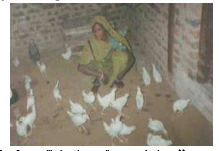
"View of Live stock development by beneficiaries after training"

Through 7 shorter trainings of three days each, SVSS has reached out to 26 villages. The feedback received from the project office of SVSS is very enthusing. There has been an increase in the number of goat keepers, Rabbit rearing after the training. Beneficiaries are now able to prepare nutritious feed for their stock using locally available ingredients reducing dependence on market to a great extent as well as the costs. This apart, the spate in number of kids has led to sales and further income flows Renewable Energy and Environment