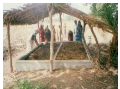
"Vermi Compost pit"