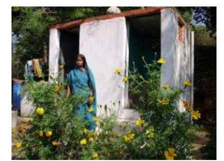
"View of JPRC Visit"