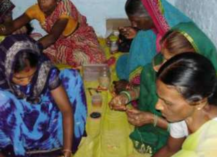
"View of Stitching, Embroidery, Beadwork, Artificial Jewelry, Readymade Garment training" World Food Programme