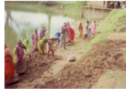
"View of Community Initiatives of Water Conservtion"

The programme will be anchored by democratic local level committees like watershed Development Committee, various Users' Groups and SHGs. Capacity building events have been built into the programme. The basic goal of the project is to enable the village community on the path self-reliance and to reach a level of confidence to leverage more programs from the government.