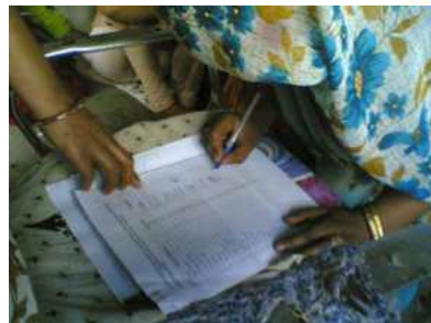
"View of Micro Credit activities with SHG member"

The implementation of the programme in 16 villages of Nasrullaganj Block of Sehore District and disbursed cumulative of Rs 90,000.