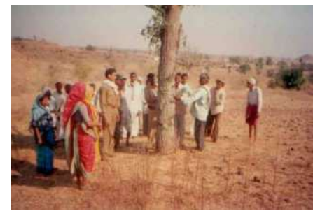
"View of Capacity Building of JFMCs"