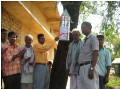
Orientation workshop for Dist. Admin. Dept., Red ribbon & condom distribution, Installation of Condom vending box" It is important that this huge resource of health care providers should utilize and their skills upgraded in our fight against HIV/AIDS. Training programme is supported by MPSACS (STI/STD Cell).