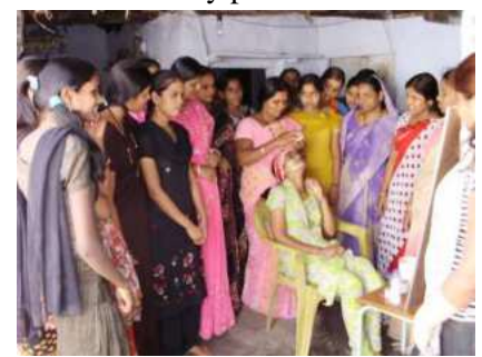
"View of Practical Training of Beautician"